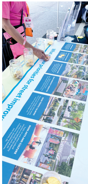
Participant interacting with priorities activity at Open Streets