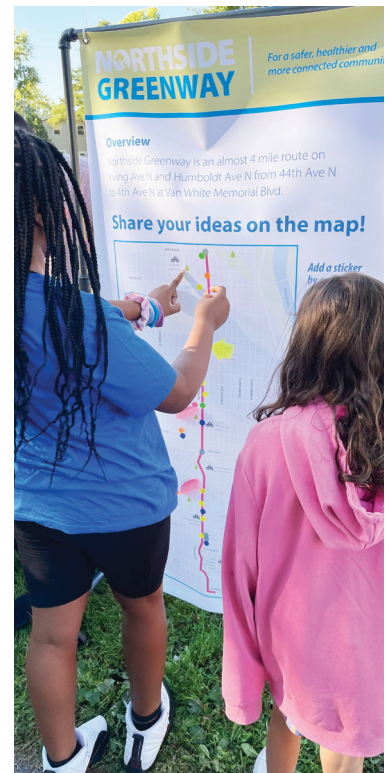
Young participants placing stickers on corridor map at Glen Gale Park