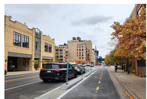
KHAD AMAAN AH OOBUSHKULEETIYADA AH