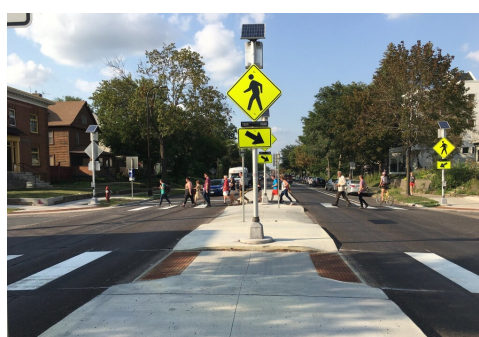
KALA QEYBI DADKA LUGTA AH