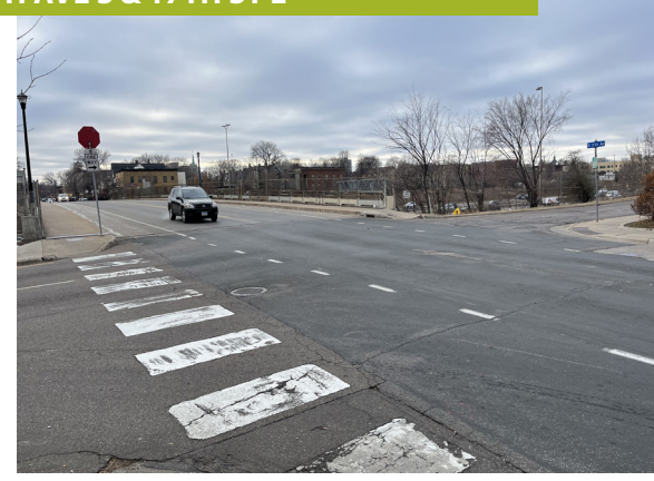
11TH AVE S & 15TH ST E