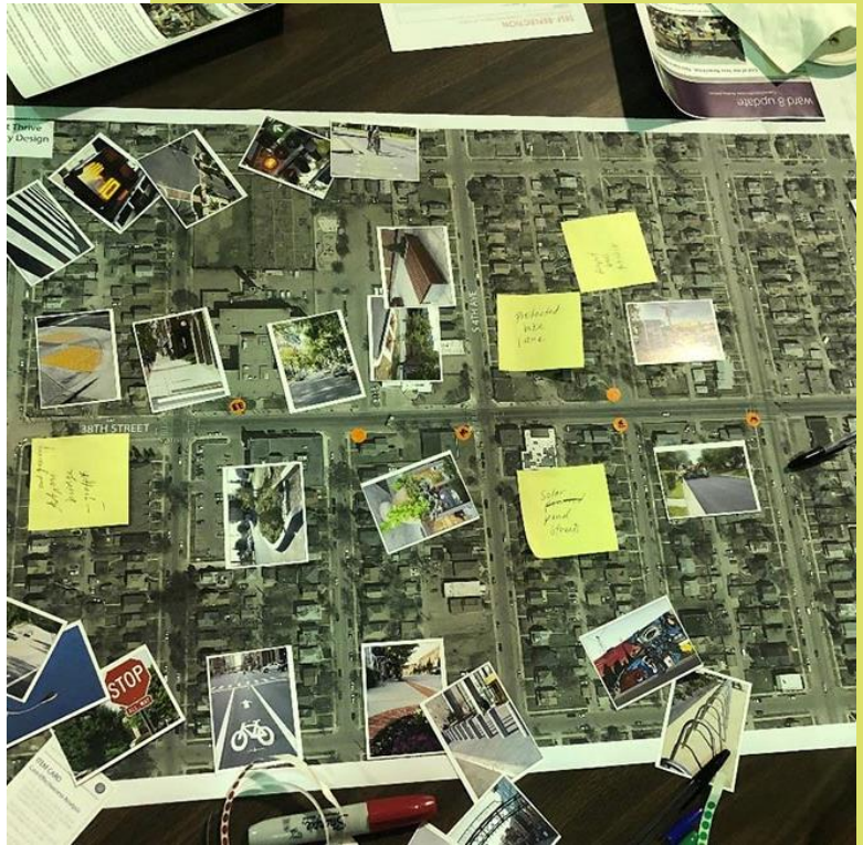
A satellite map of 38th Street in Minneapolis is covered in photos and sticky notes from a strategic development planning meeting.