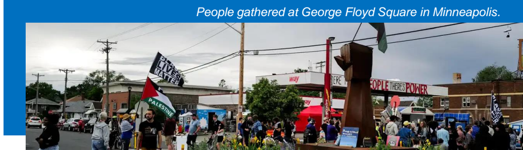
People gathered at George Floyd Square in Minneapolis.