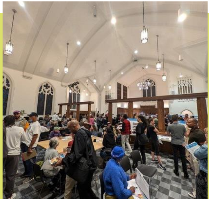
Community members met at Calvary Lutheran Church in Minneapolis to review the development plans for George Floyd Square.