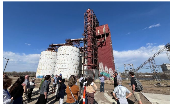
Tour of Upper Harbor, which is being reimaged as a park, music venue, and more

“Streamline to Skyway: Exploring Modernism in Minneapolis”; “Nashe Micto (our city): Ukrainian Influences on Minneapolis”; and “Exploring Recent Minneapolis Examples in Historic Church Reuse”