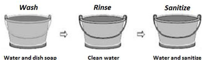
C. Utensil Washing Setup