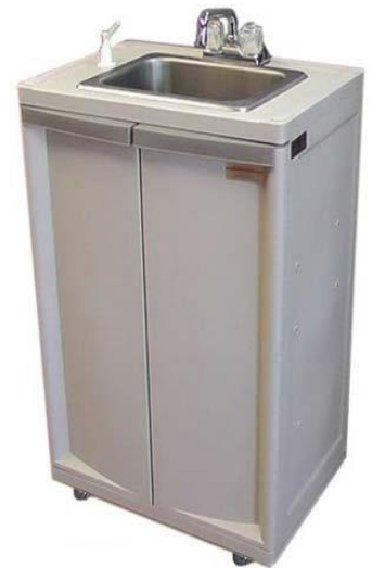
A. Hand Washing Setup