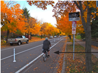
Similar improvements on Blaisdell Ave S

http://www.minneapolismn.gov/cip/future/emerson-fremont