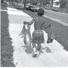
Lake Street USA