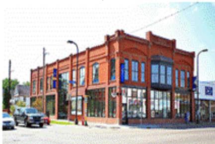
1101 West Broadway