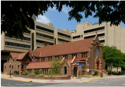
Grace University Lutheran Church

Outstanding preservation achievements in Minneapolis were celebrated at the 2008 Minneapolis Heritage Preservation Awards on May 22 nd at International Market Square. The event was sponsored by the Minneapolis Heritage Preservation Commission, the Minneapolis Chapter of the American Institute of Architects, and Preserve Minneapolis.