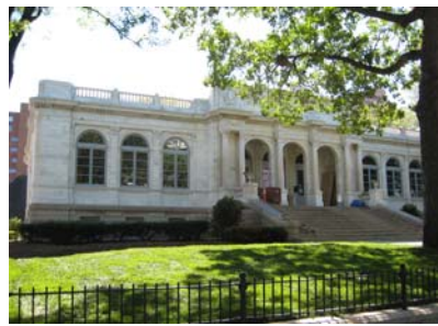
St. Anthony Falls Office Building