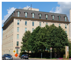
Crown Roller Mill building 105 5th Avenue South Minneapolis, MN 55401

The Crown Roller Mill building is about six blocks northeast of the Government Plaza Light Rail station. When you exit the train at the Government Plaza station (intersection of 5th Street and 4th Avenue), turn right onto 4th Avenue. Proceed north on 4th Avenue for three blocks to Washington Avenue. Turn right onto Washington Avenue and walk one block east to 5th Avenue. Turn left (north) onto 5th Avenue and walk 1 ½ blocks to the Crown Roller Mill building. (The entrance is on 5th Avenue just past the Ceresota building.)