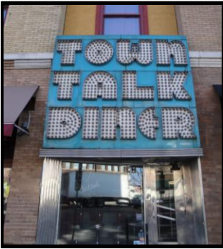
Town Talk Diner

A 2.5-story split gable residence designed in the Shingle Style with shake siding in the upper stories and lap siding on the ground level. Eligible under Criterion #4 for its embodiment of the Shingle Style of architecture, and Criterion #6 for its association with master builder Maurice Schumacher and master architect William Kenyon.