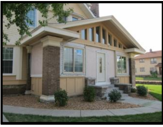
Laura Chase Residence